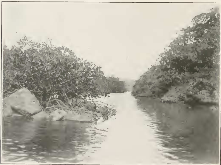
UPPER: COASTAL FOREST ON PULO JIMAJA, ANAMBA ISLANDS, THE HOME OF HORIZILLAS MAGNIROSTRIS AND AETHOPYGA SIPÁRAJA OCHROPYRRHA .